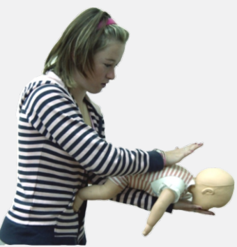
This is one method for infant- if having to act quickly where no seat is available to allow for positioning over the first aiders thigh.

Infant: Back blows - head downwards so gravity will assist with expulsion. Across your lap/thigh or over your arm. Chest thrusts – turn over.